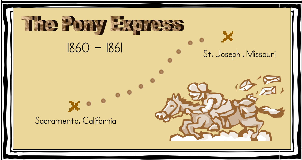
Pop Up Book Cover

Fold back and down. Glue this to back of notebook page or file folder.