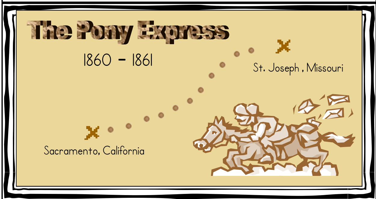
Pop Up Book Cover

Fold back and down. Glue this to back of notebook page or file folder.